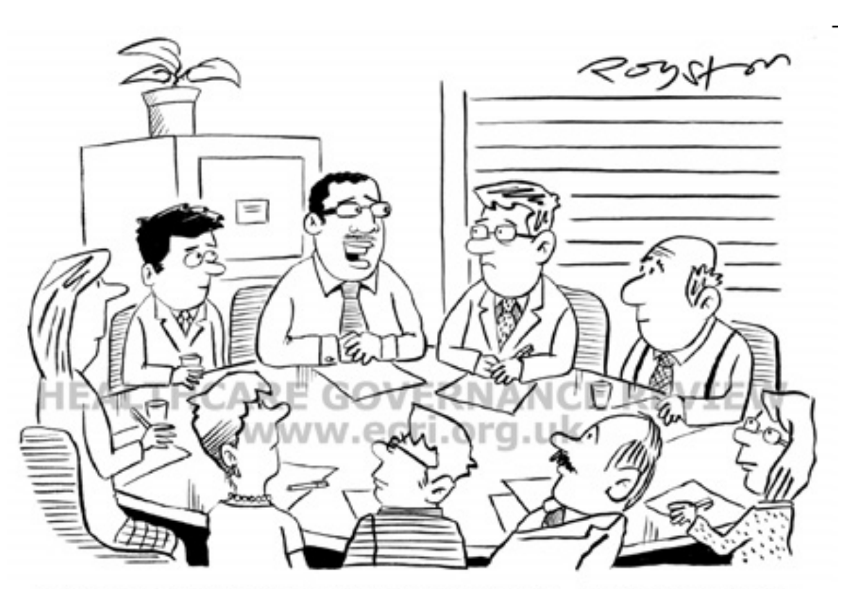
"It's a pleasure to be joining the board, but I'd prefer it if you called me David, rather than The BME Guy."